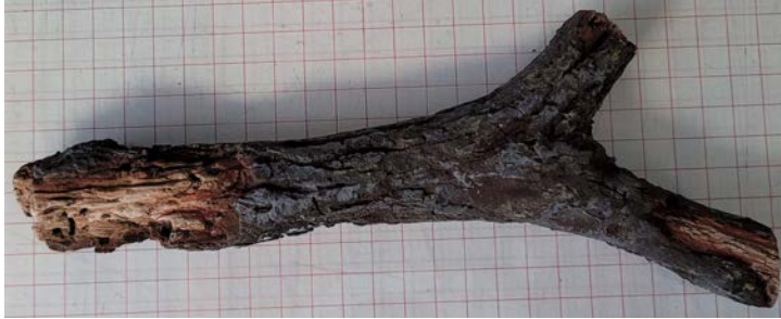
35-01-02015 LEFT FRONT LOG

Open the packaging and remove the logs. Use the guide below to identify the logs.