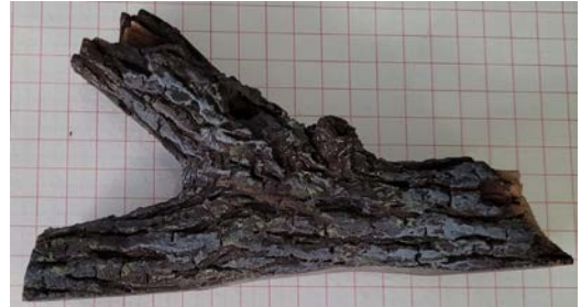
35-01-02014 LEFT BACK LOG