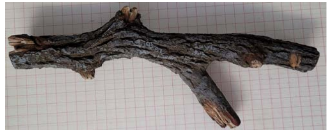
35-01-020 CENTER FRONT LOG