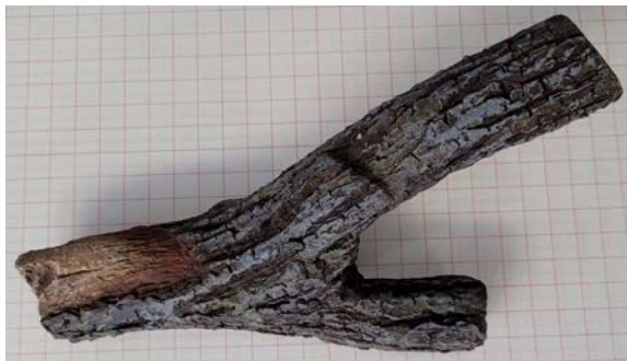
35-01-02019 RIGHT FRONT LOG