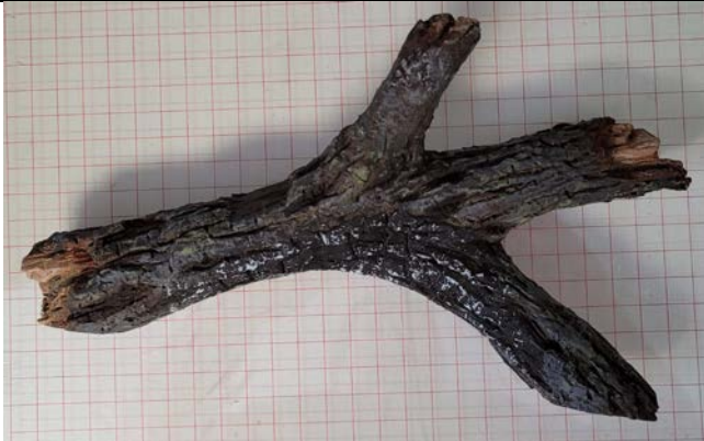
35-01-02016 CENTER BACK LOG