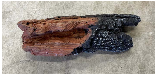
35-01-02078 LEFT BACK LOG