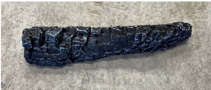
35-01-02081 RIGHT BACK LOG