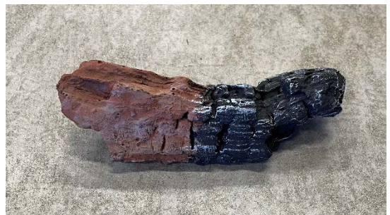
35-01-02082 FRONT CENTER LOG