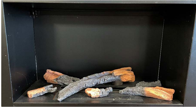
40" Waterplace Burner