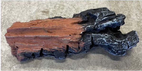
35-01-02077 LEFT FRONT LOG

Open the packaging and remove the logs. Use the guide below to identify the logs.