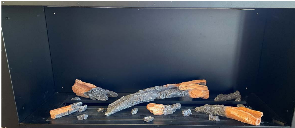
60" Waterplace Burner