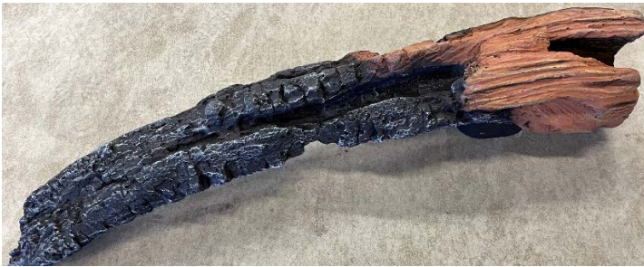
35-01-02079 BACK CENTER LOG