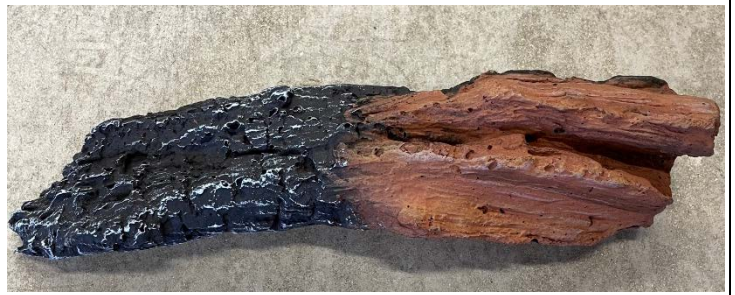
35-01-02080 RIGHT FRONT LOG